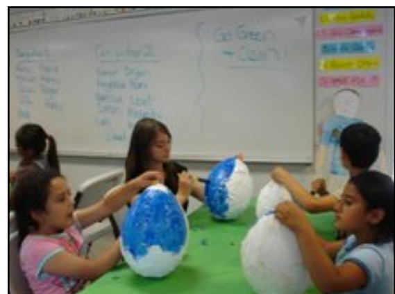
Students paint their paper mache globes while learning about taking care of the earth.