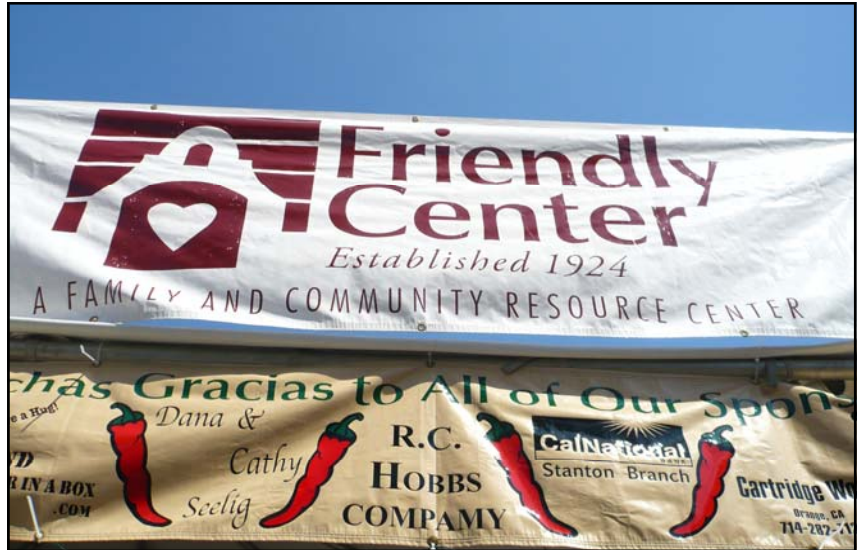
Chili Pepper Banners at the 2008 International Street Fair.